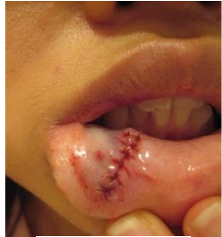
Stitches to close a laceration in lower lip