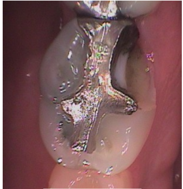
A common scenario

Most breaks are minor and can be attended to at a reasonable convenience. How do you know if it's not just a minor break? If you start experiencing significant pain or facial swelling, you've probably got more than a broken tooth to deal with.